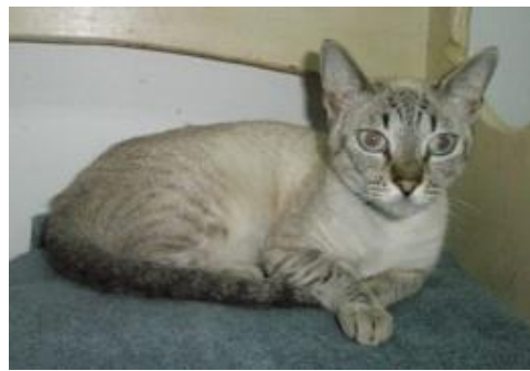
Queen of Sheba

We pride ourselves on having the “cat-friendliest cats in town”. Due to our free-roaming facility, even the grumpiest feline learns that life can be better when living with cats! We also are pleased that we are able to help cats and kittens that need extra attention. We continue to take in pregnant and nursing momma cats, orphaned newborn bottle-baby kittens, senior cats, and cats with medical conditions needing extra care.