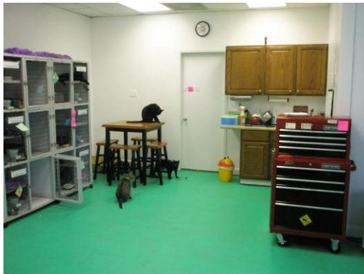
Our main cat room