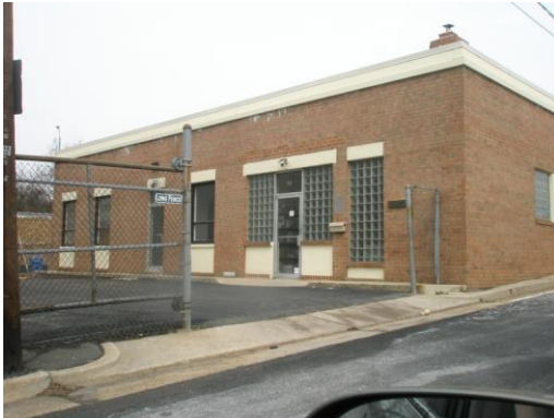
Our new cat orphanage

King Street Cats had a very exciting 2009. In July, we said goodbye to our longstanding location at 213 King Street. It was sad to leave the heart of Old Town and all the wonderful visitors, but our new location just off of Duke Street is much larger, brighter and the kitties are happy with the abundance of windows and sunlight. We have two rooms to house our kitties: one larger room (with the green floor) that has a fun cat walk on the wall and a kitchen (which has become a mainstay for kitties that love to drink from the faucet). We also have a second room that is an isolation room for new arrivals, kittens and our elderly kitties. Our landlord has been wonderful to us in providing renovations to help make the orphanage more cat-friendly.