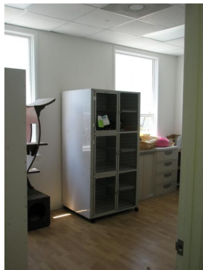
Our isolation room