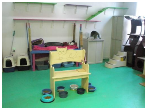
Our main cat room