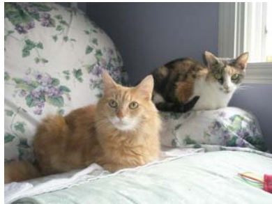
Luke & Leia

Then came Luke & Leia who were found abandoned in a home in D.C. They were locked inside without food or water. No one knows what happened to their family but when police discovered them they were barely alive. Washington Humane Society provided initial care to Luke & Leia and then transferred them to King Street Cats where we spared no expense to save these sweet cats. After spending two months in foster care and having several close calls requiring emergency veterinary visits, Luke & Leia were on their way to their happy ending. These two bonded cats were adopted together to a wonderful family in Falls Church. They had a mom, dad, and four kids who showered them with love. Although Luke & Leia struggled to eat after their trauma, everyone was hopeful for a full recovery. Unfortunately Leia passed away in the arms of her family a few months later. And while we all mourn the loss of Leia, Luke is doing well and is very loved by his family.