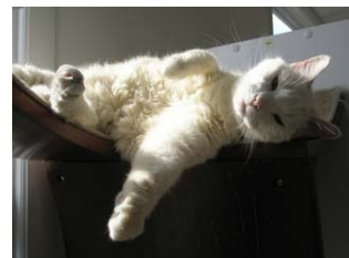
Moloko (8 years old)

King Street Cats always welcomes back cats that have been previously been adopted. While we work with families on options to keep their kitty, we understand that there are situations where the cat needs to be returned and to find a new home.